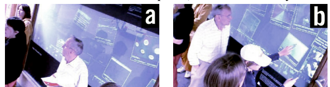
Figure 4. Shelter from the rain

The presence of other users is important to the way new users arrive at the display. In 19% of the cases, CityWall was already in use by someone else when a new user entered the display and started using it. Given that the display was in use 8.8% of its total uptime, this indicates very sim-