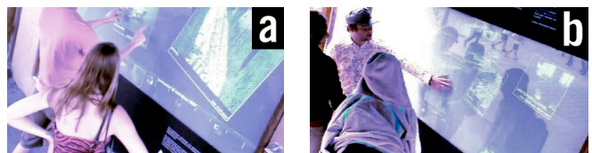
Figure 12. Teacher-apprentice setting

Content on the wall and features of the interface were used as resources to coordinate the activity and to create events