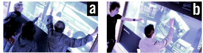
Figure 10. Pondering grip vs. grandiose gestures

In Figure 10a, the woman on the left is carefully moving objects around the left side of the wall. In contrast, the couple on his right is performing scaling up with grandiose gestures, on the verge of entering her personal space. In Figure 10b, the man on the left is holding a photo in his hand, keeping it in constant small movement, waiting for