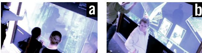
Figure 8. Conflict management by withdrawal

In Figure 8a, the activities of the two groups conflict when the man on the left accidentally blows up a photo so that it goes on top of the photos that the group on the right was working on. They both turn their gaze towards the other group, and pull their hands out from the screen. In addition,