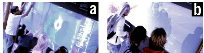
Figure 9. Social interaction inspired by conflicts

the woman places her hands in front of her chest making her withdrawal clearly visible to the other team.