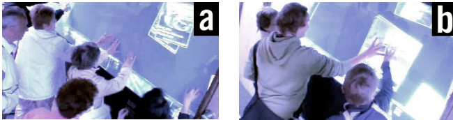
Figure 7. Teamwork

Teamwork is sometimes also a way of dealing with physical obstacles, or it can be adopted because it is more fun that way, or both. In Figure 7b, the two men are both holding a can of beer in their hand and, because of that (or inspired by it), they start scaling up the photo each grabbing one corner. Although CityWall was designed to enable two-hand usage, we observed many people using it with one hand only. As two-hand usage was not enforced (all moving, zooming and panning activities could also be done one handedly), this may have something to do with personal preferences, but not always. Not unusually was one-handedness due to a physical obstacle, as in the example above. It appears that people in downtown Helsinki are carrying all sorts of bags, skateboards, cameras, mobile phones or other items.