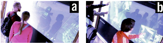
Figure 5. Stepwise approach to the wall

ply that seeing people using the display served as an attractor for more users.