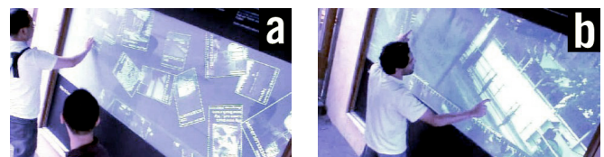
Figure 11. Leaving a mark

There are several ways of leaving a mark. At exit, people can, for instance, give momentum to the timeline or desktop so that photos fly there for a moment, or they can select a funny or embarrassing photo to leave on top.