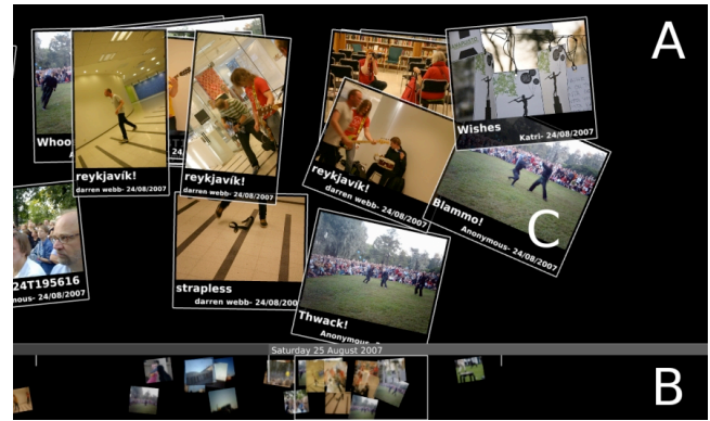
Figure 1. Screenshot of CityWall with Flickr content.

Interaction with the top part (B) of CityWall follows two interaction paradigms. Moving, scaling and rotation of content (C) follows direct manipulation principles: a user can grab an image by putting a hand on it. The photo follows the hand movements when the user shifts her hand. Rotation and scaling are possible by grabbing the photo at more