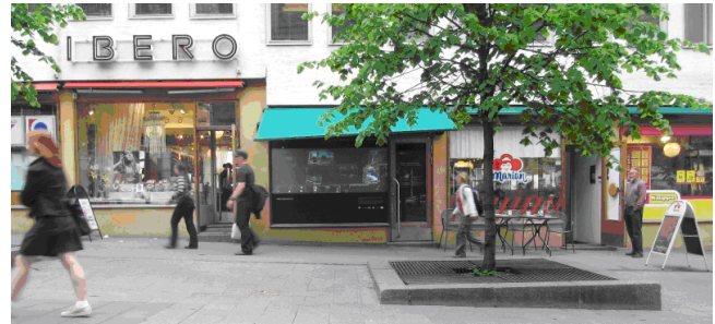
Figure 2. CityWall installation in Helsinki, Finland.

than two points (e.g. by two hands or two fingers of the same hand) and then either rotating the two points around each other or altering their distance.