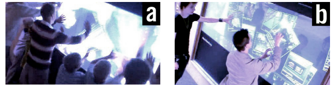
Figure 6. Parallel use

Two baseline patterns of multi-user interaction were observed. Firstly, in parallel use , people can occupy an area of the screen and focus on their own task irrespective of the