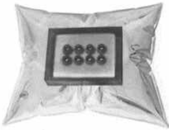
Figure 3: The Pillow

displays are blurred as they permeate the form (Figure 3). These shapes join with processed sounds to indicate passing electromagnetic information from mobile phones, taxis, commercial radio and television, making the Pillow into an unusual sort of radio – one that, moreover, casts the viewer into a voyeuristic relationship with the otherwise invisible information that surrounds us.