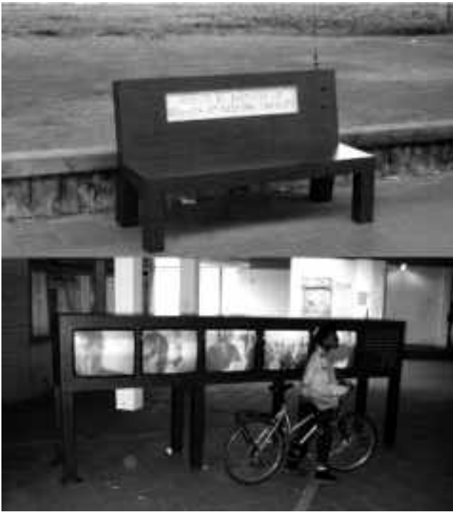
Figure 1: Sloganbench (top) and Imagebank (bottom)