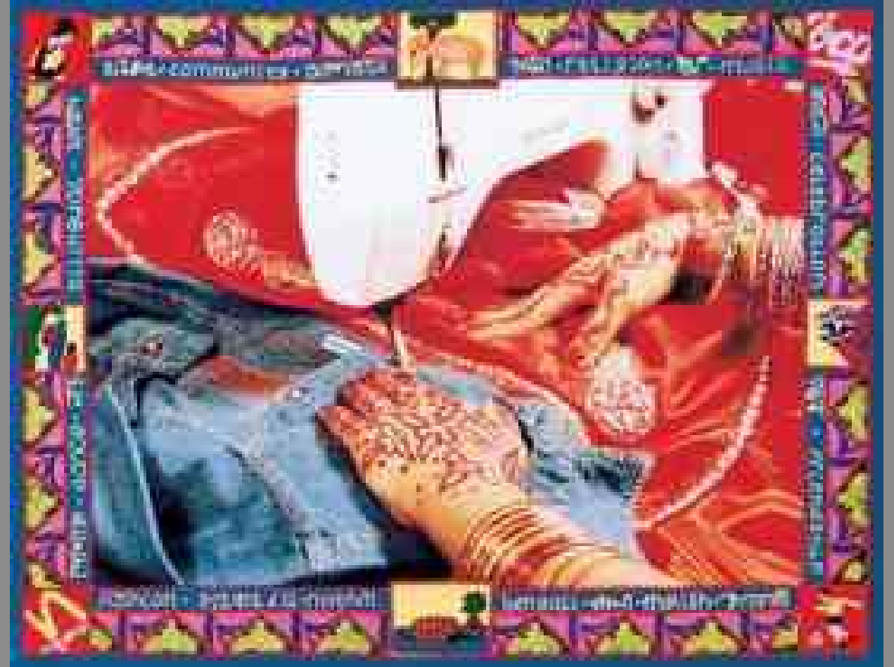
East Meets West