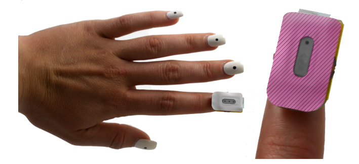
Figure 1. AlterNail being worn and closeup of an AlterNail design.

DOI: http://dx.doi.org/10.1145/3025453.3025924