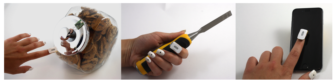
Figure 3. Left: Credits and Usage scenario demonstrated with an AlterNail enabled cookie jar. When the user opens the cookie jar, a new dot is added to their AlterNail display. Middle: Object Status scenario demonstrated with an AlterNail enabled chisel. As displayed by the AlterNail, this tool has been used three times today. Right: AlterNail updated through NFC from a smartphone. The user can discreetly check that they have one new email without unlocking and looking at their phone.

cause the team's logo to appear across the AlterNail, rather than requiring the user to be in contact with a particular AlterNail enabled turnstile. The smartphone would detect the user's location, determine the appropriate e-ink configuration, and power/communicate with the AlterNails via NFC.