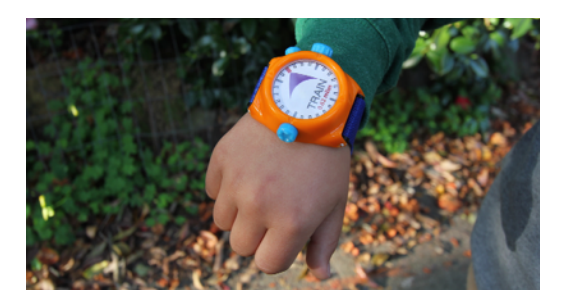
Figure 5. Adventure Watch indicating nearby train tracks.

Unlike a traditional GSP units, the Adventure Watch is a GPS device that provides an abstracted proximity indication to an intentionally limited and selectable set of "places" of interest to children - parks with cool slides,