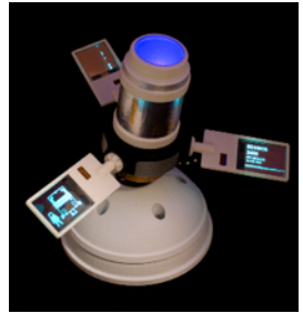
Figure 6. Overhead (illuminated and in darkness) communicating location by pan/tilt and displaying detailed satellite facts on its clear screens during each orbital flyover.

forms and experiences beyond today's touch screens. Getting dirty with crowd-sourced sandbox sensing, playground curiosities, and real-time orbiting satellites generates a narrative essential to this debate of technologies for children and our future devices.