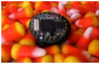
Figure 3: Wireless Dot style Mote