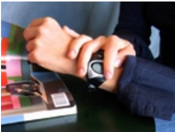
Figure 4: Connexus Scenario: Tapping to send message, received as ambient glowing, and sliding finger to acknowledge message.