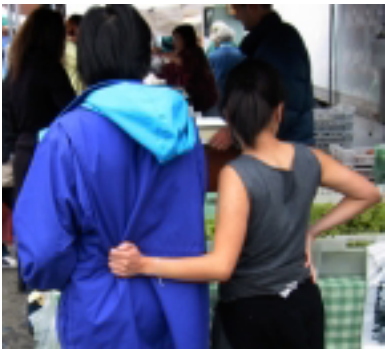
Figure 1: Nonverbal, ambient, co-located, awareness communication observed during initial user studies