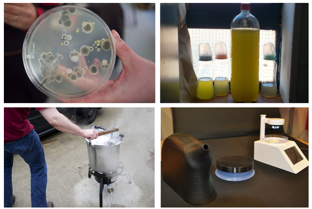
Figure 1. Swab sample collected by DIYbio Manchester, image source http://diybio.madlab.org.uk/ (top left); algae biofuel project at London Hackspace (top right); sterilization with pressure cooker at Bosslab, image source http://bosslab.org/ (bottom left); our speculative prototypes exploring opportunities for HCI at the seams (bottom right).

Microsoft Research<sup>2</sup> 7 J J Thomson Avenue, Cambridge, UK {ast, timregan, nvillar}@microsoft.com