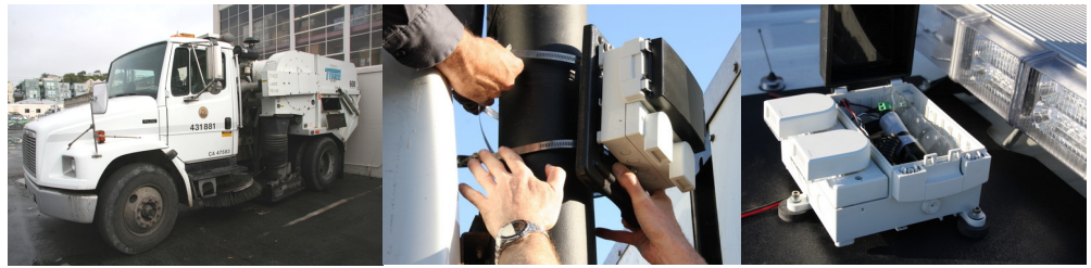
Figure 2. Enclosure-mounting the sensor package on city street sweeping vehicles.

the environmental decision-making process – generally remains beyond the scope of art projects. As has been recently noted, this risks making community members highly aware of problems without making it equally clear how to address them [8].